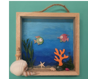
Ocean Shadow Box