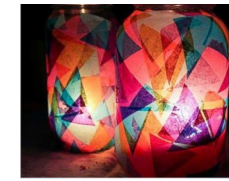
Stained Glass Luminary