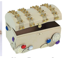
Pirate Treasure Box