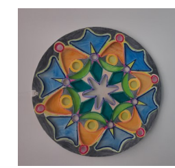
Stained glass Mandala