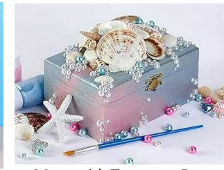
Mermaid Treasure Box