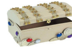
Pirate Treasure Box