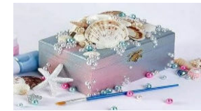
Mermaid Treasure Box