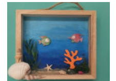
Ocean Shadow box