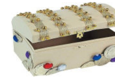
Pirate Treasure Box