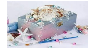
Mermaid Treasure Box