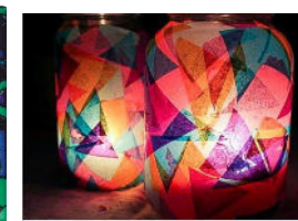
Stained Glass Luminary