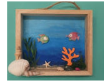
Ocean Shadow box