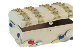
Pirate Treasure Box