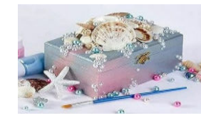
Mermaid Treasure Box