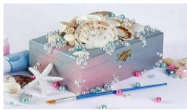
Mermaid Treasure Box