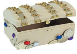
Pirate Treasure Box