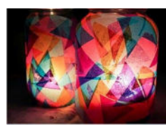
Stained Glass Luminary