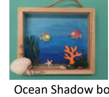
Ocean Shadow box