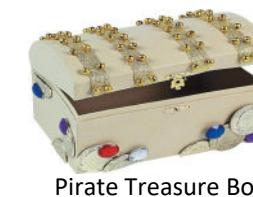
Pirate Treasure Box