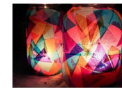
Stained Glass Luminary