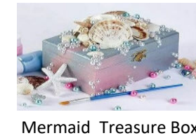
Mermaid Treasure Box