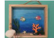
Ocean Shadow box