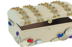
Pirate Treasure Box