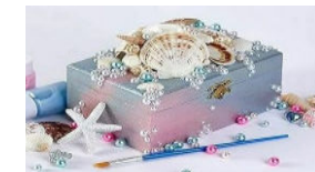
Mermaid Treasure Box